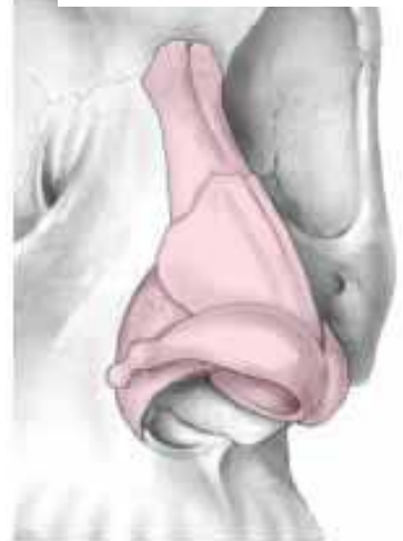
The osteo-cartilaginous structure of the nose